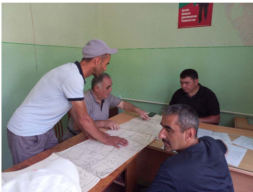
Photo 1: National experts brainstorming the demo project's implementation

Due to the mountainous landscape over 50% of the irrigational land of Tajikistan requires the support of the pumping stations. Annually about 1.5 bln kWh of hydro-generated electricity is consumed by the pumping stations. Out of which about 1 bln kWh comes only for Sughd Province as it is located in the lowland of Syr Dariya River. The outdated irrigational infrastructure (40.6%) fails to deliver the high-quality service to the end user as dekhan households that reflects on the low collection rate for water transfer fee (below 80%). Annually, electricity bills makes 118 million somoni (11 million EURO), the fee received from the water users makes around 40 million somoni (around 3,8 million EURO). The difference between the bill and collected amount is charged by Barki Tojik as a debt to the Agency for Land Reclamation and Irrigation under the Government of the Republic of Tajikistan (ALRI). For the first quarter of 2022, debts for used electricity have been accumulated for the amount equal to 364 million somoni (34 million EURO) that ALRI cannot repay and remains in debt to Barki Tojik. Although, back in 2014 and 2018, the Government already written off the debts for the electricity bills of ALRI to Barki Tojik in the