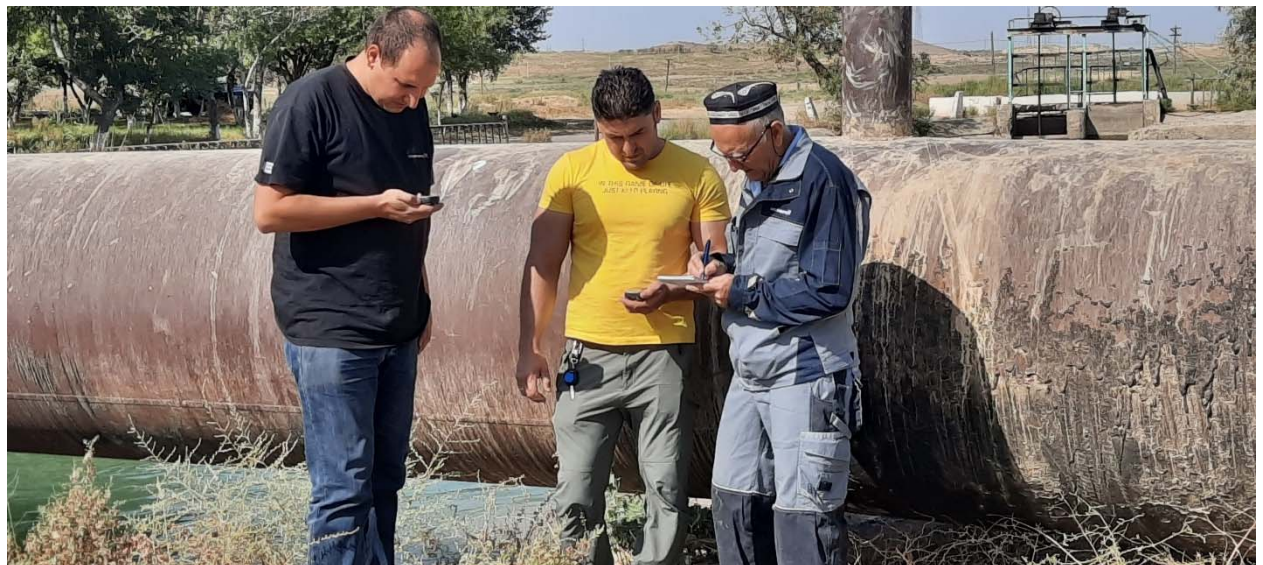
Photo 3: Grundfos specialists and local municipality during the energy audit conduction

The findings of Grundfos that revealed that pumping stations actually pump de facto less water than declared in their technical specifications explain why the irrigational water does not reach the end users in particular in the lower part of the irrigational channels as TM-1 and TM-2. The lack of water forces the farmers to drill wells without conducting any geological surveys. It was found